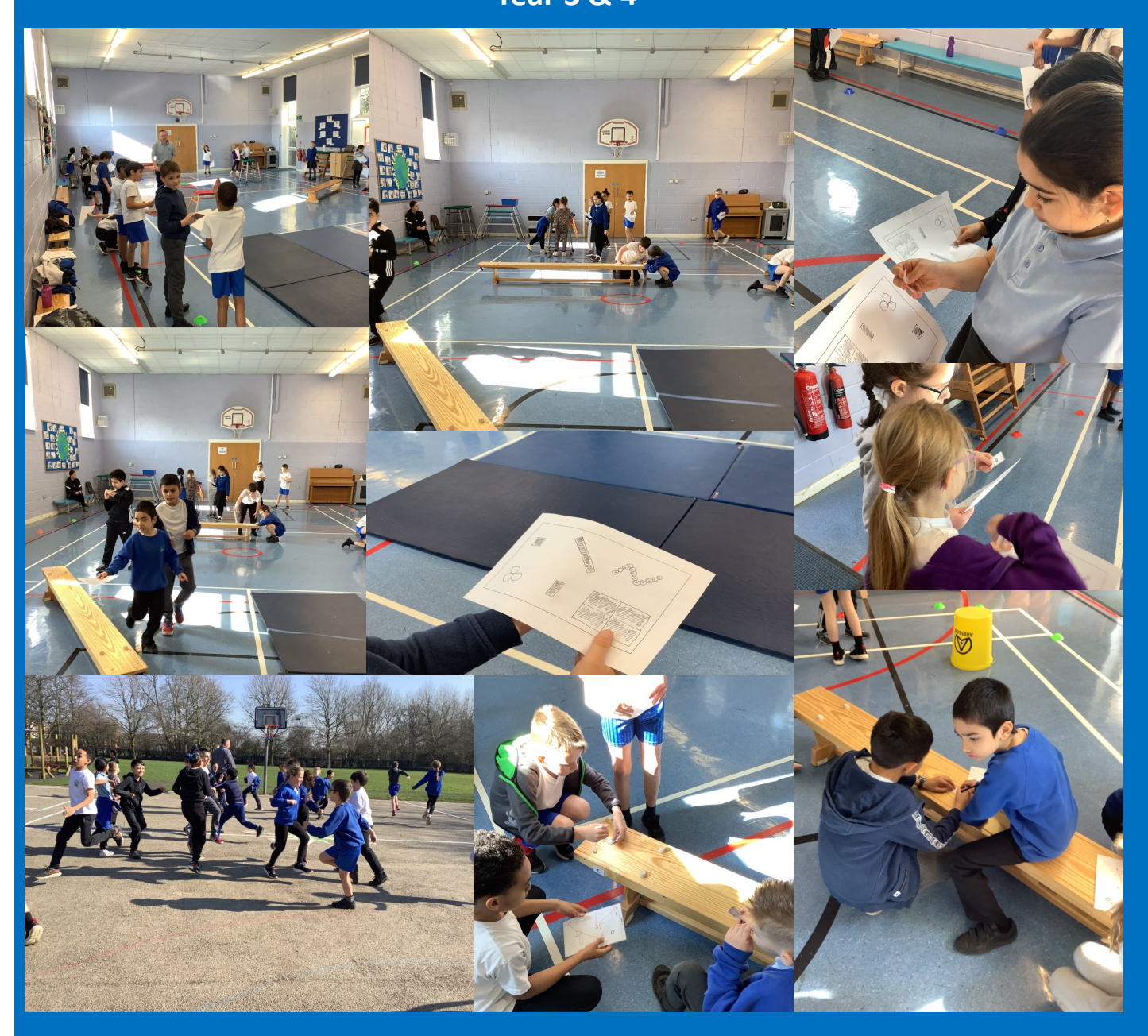
Year 5 & 6 Basketball Teams